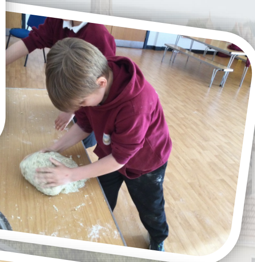
Holly Class Cooking Sessions